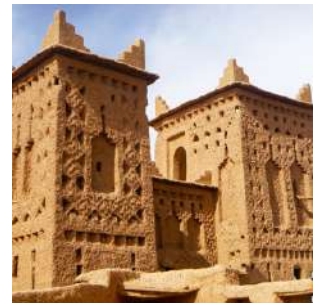
The Ameridil kasbah of Skoura