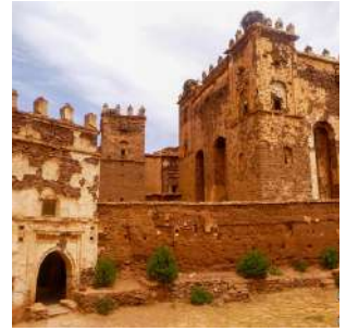
Kasbah of the Glaoui in Telouet

Breakfast and departure for the kasbah of TELOUET, a vast complex of buildings abandoned in 1956 belonging to the legendary Glaoui family, the largest and most ambitious of the tribal chiefs. The buildings are slowly sinking into the red-brown earth, but the site is one of the most scenic monuments in the Atlas range where the finely decorated halls are still clearly visible. We will drive along the scenic hairpin bends of the Tizi n'Tichka pass (N9) which will take us to MARRAKECH where we will immerse ourselves for the first time in the atmosphere of the Jemaa el Fna square, with snake charmers, musicians, street performers and, from sunset, mobile kiosks where we can sample Moroccan cuisine. Overnight stay at Riad Dar Khmissa or similar, in a double room with services.