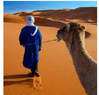
On the dunes of Erg Chebbi

Breakfast and a day's transfer during which we will stop in the ski resort of IFRANE, an anomalous Moroccan town with its parks, lakes and Alpine-style villas laid out along wide tree-lined streets. We will arrive in MERZOUGA in time to admire the sunset over the ERG CHEBBI dunes, up to 150 metres high, which mark the border with Algeria. Dinner and overnight stay in a fixed tented camp with external toilets.