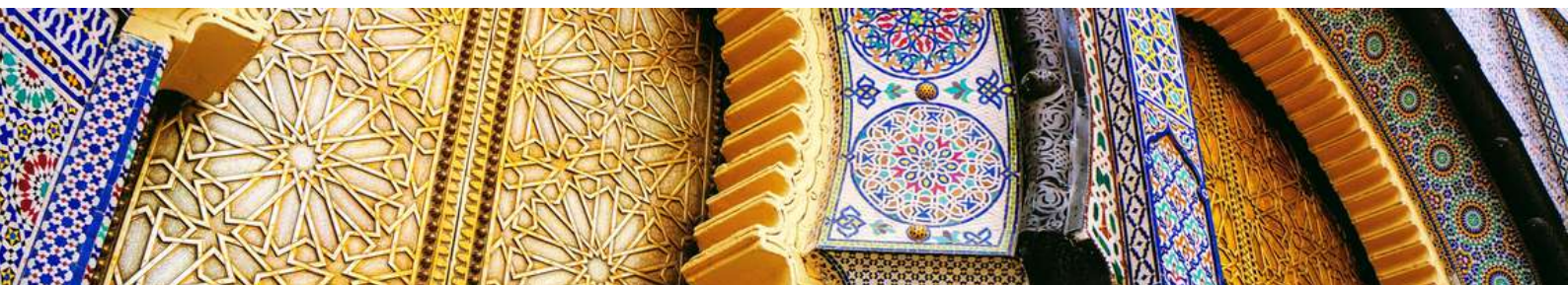
Imperial Gate in Meknes