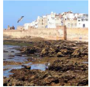
Town of Essaouira

*Departure from Casablanca (CMN) also possible.