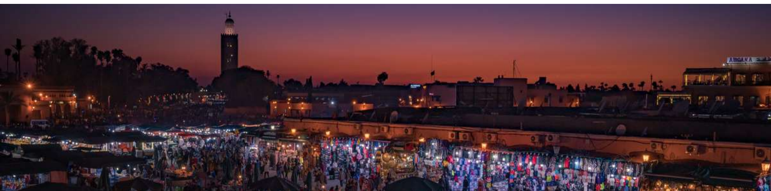
Jemaa el Fna square