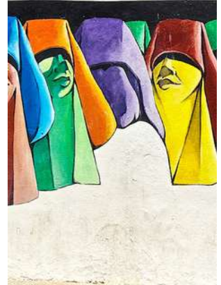
Murals in Asilah