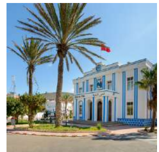
Spanish colonial architecture

Breakfast and visit to TAFRAOUTE, a picturesque town made up of several stone villages in the midst of large rock formations of disparate shapes. A scenic route will take us to little AMTOUDI to learn about its agadir, an extraordinary fortified granary with ramparts and towers, which can be reached on foot or on donkeyback via a steep zigzag path. We then head towards the Atlantic coast, to the Spanish colonial town of Sidi Ifni. Overnight stay at the Maison d'hote Logis La Marine or similar, in a double room with services.