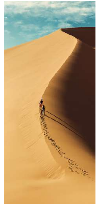
The immensity of the Sahara

Breakfast in the tented camp. A chance to admire the sunrise over the dunes before setting off for the SKOURA oasis, a large palm grove with a network of paths surrounding the fords and palm trees. Here we will visit the richly decorated Ameridil kasbah, built in the 17th century for the caid of Skoura and featured today on the 50 dirham note. Continue to AIT BEN HADDOU, well known for the films that were shot there, such as David Lean's Lawrence of Arabia, Orson Welles' Sodom and Gomorrah, Franco Zeffirelli's Jesus of Nazareth and Ridley Scott's Gladiator. The kasbah, dating back to the 11th century, sits on a low hill rising above a shallow river with well-preserved, elaborate earthen buildings with towers, battlements and sheer walls. Overnight stay at the Guesthouse Bagdad Café or similar, in a double room with services.