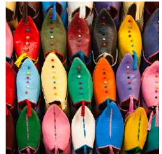
Babouches for sale in the souk

Breakfast and full day dedicated to visiting the imperial city of MARRAKECH, which has always been a centre of trade and a meeting place for tribesmen and Berber villagers. Also called the 'red city' because of the natural pigments adorning its buildings, it is divided into two parts: the ancient medina, founded in the Middle Ages by Sultan Youssef Ben Tachfine, and the colonial Ville Nouvelle, built by the French in the mid-20th century. The heart of the medina is the Jemaa el Fna square from which you can see the unmistakable minaret of the Koutubia, a classic example of Almohad architecture. Noteworthy monuments include the Madrasa Ben Youssef, with its stucco, Zellij decorations and cedar wood carvings, the Bahia Palace, the ideal of Arab architecture in a 19th century palace, and the jardin Majorelle, a refined garden with cacti, water lilies and a fine museum of Islamic art. Overnight stay in a riad.