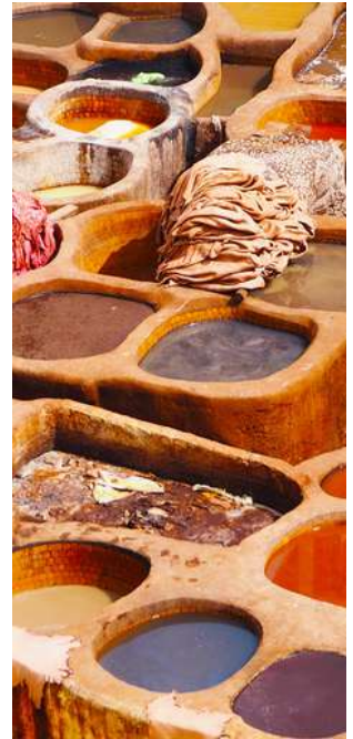
Tanneries of Fez

Breakfast and transfer to the city of FEZ, the oldest of the four imperial capitals of Morocco. We will delve into the city's souks, which extend for over 1 km and preserve the tradition of urban handicrafts. The medina is divided into two separate parts: Fez El Bali (old Fez) and Fez El Jedid (new Fez): the former is an intricate maze of alleyways, madrasas and souks, while the latter is dominated by a large area of royal palaces and gardens. We will learn about the tanneries, tanks for dyeing leather whose use has not changed since medieval times. Overnight stay at Riad Tara or similar, in a double room with services.