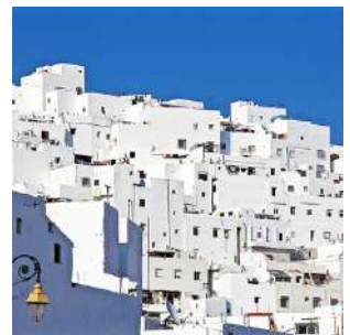
The white medina of Tetouan