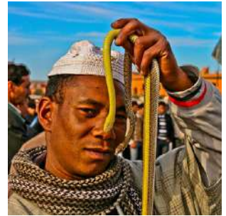
In the Jemaa el Fna square