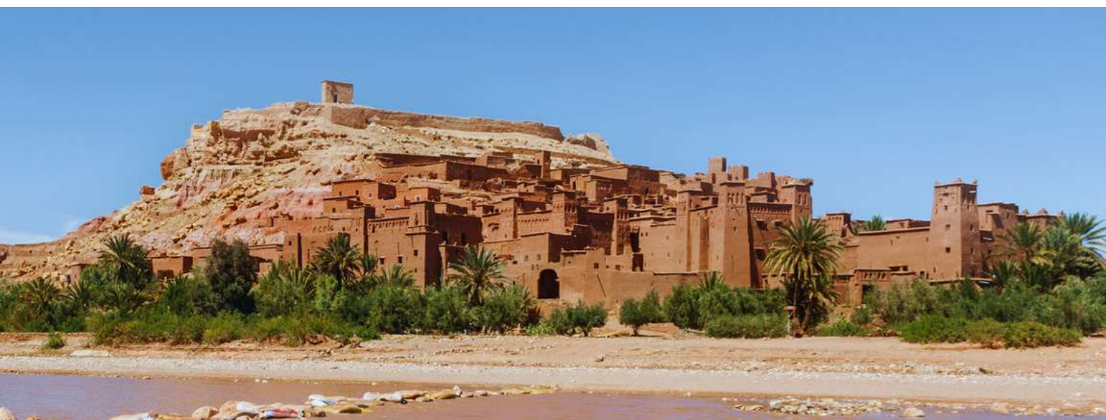
Ait Ben Haddou Kasbah