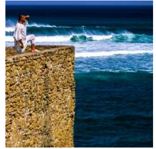
Bastion in El Jadida

Breakfast and morning dedicated to visiting RABAT, with the famous mausoleum of Mohammed V, designed by a Vietnamese architect, located in front of the Hassan Tower. We then move to ASILAH, one of Portugal's most elegant ports on the Atlantic, with its square stone ramparts surrounded by palm trees and one of the country's most interesting medinas with pastel colours and characterised by murals created for the International Cultural Festival, an event that attracts artists from all over the world. Continuation to the picturesque coastal town of TETOUAN, situated at the top of a slope in a large valley against a mass of dark rock. We visit the medina, one of the best preserved in Morocco, declared a UNESCO World Heritage Site for its typically Moorish architecture. Continuation towards the 'blue city', Chefchaouen. Overnight stay at Riad Dar Echaouen or similar, in a double room with services.