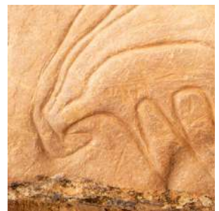
Engraving at Ait Ouazik

Breakfast, followed by a trip to the DADES GORGES, characterised by its steep limestone slopes and eroded rocks. We will then move on to the site of AIT OUAZIK, where we will observe rock engravings made on dozens of stone slabs. This prehistoric art mainly represents the fauna of the time, when the Sahara was a verdant savannah: elephants, antelopes, rhinoceroses, giraffes, felines, ... We continue the day by reaching one of the most beautiful examples of southern architecture, the ksar of TAMNOUGALTE, perched on a hill and one of the oldest in Morocco. This ruined village, made up of ornate buildings with ashlar walls and tapering towers, was the capital of the region and the jema'a, made up of the assembled families, administered the independent republic. Overnight stay at Riad Dar Amazir or similar, in a double room with services.