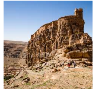
Fortified granary of Amtoudi