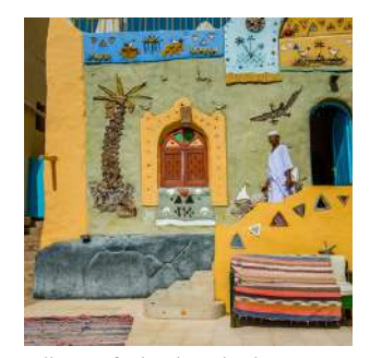
Village of Gharb Sohail