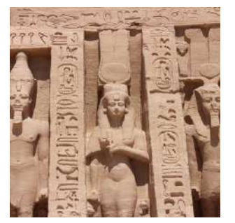
Temple of Nefertari