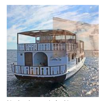
Navigation on Lake Nasser