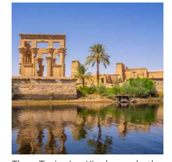
The Trajan's Kiosk and the Philae Temple