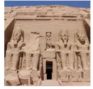
Temple of Ramses II

After breakfast transfer to the airport in time for your return flight or onwards to other destinations. End of services.