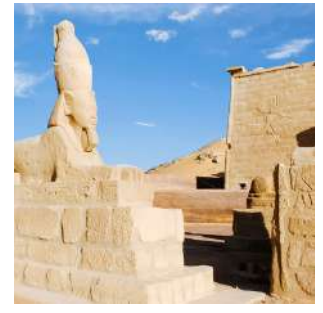
Sphinx at Wadi el Seboua