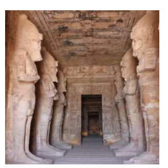
Inside the Temple of Ramses II