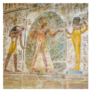
Tomb of Pennout