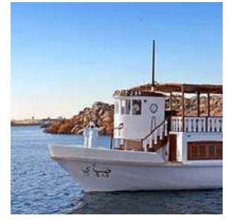
On board the dahabeya