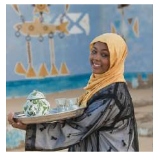
Welcome to Nubia!

Breakfast on board. Navigation to WADI EL SEBOUA, where we admire the temples saved by UNESCO. The temple of DAKKA, dedicated to the god Thot, was erected at the end of the 3rd century BC by the Meroitic king Arkhamani, a contemporary of the pharaoh Ptolemy IV, and later enriched with new decorations under other Ptolemaic rulers and extended by the Roman emperors Augustus and Tiberius. The temple of WADI EL SEBOUA, a semi-rural site commissioned by Ramses II, was dedicated to the god Amon-Ra and Ra-Harakhiti. It is entered through an impressive avenue adorned with sphinxes with the likeness of the deified ruler and the lion's body. Finally, we visit the adjacent site of MEHARRAQA, built at the behest of Augustus and dedicated to the syncretic deity Serapis (a fusion of Osiri, Arpis and Zeus) and the goddess Isis, consisting of a hypostyle hall and a colonnaded portico. Back on board for lunch. Short boat trip to WADI EL ARAB, an area of fine sand dunes where we will take a pleasant walk. Navigation in the direction of Amada, during which we will be able to admire the fishermen's dwellings and the verdant shores of the lake where, with a little luck, we may spot Nile crocodiles. Dinner and overnight on board.