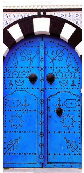
Welcome to Tunisia!

Flight to Tunis, arrival in the morning and meeting with Kanaga Africa Tours staff, assistance in changing Euros and possible purchase of a local phone card. Lunch in a restaurant. In the afternoon, stroll through the medina of TUNISI (UNESCO heritage site), discovering its souks (markets), for endless haggling over carpets, fabrics, dried fruit and spices, and a visit to the Zitouna mosque (exterior) or 'mosque of the olive tree', one of the most important mosques in Islam, built in 732 AD. and rebuilt in the 9th century, the Hammouda Pacha mosque (exterior), with its distinctive minaret, the finely decorated madrasas (Koranic schools), including the Slimania madrasa, and the late 19th century cathedral. We also climb onto a panoramic balcony for a view of the entire medina and the Zitouna mosque, and visit the modern kasbah square where the Bay palace, the town hall and the kasbah mosque stand out. Accommodation at the Hotel Carlton or similar and overnight stay in a double room with services.