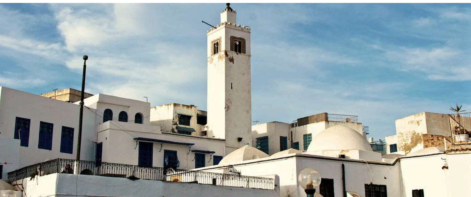
Village of Sidi Bou Said

After breakfast, departure for the village of SIDI BOU SAID, one of the most picturesque corners of the country, with its blindingly white houses punctuated by blue doors and colourful bougainvilleas, situated on the top of a cliff offering magnificent views of the Gulf of Tunis. Stroll through the narrow streets of the village, with a stop to enjoy the famous mint tea with pine nuts. Lunch in a restaurant and transfer to Tunis airport in time for your return flight. End of services.