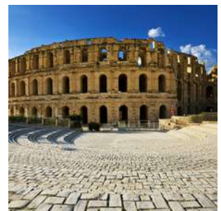
El Jem Amphitheatre