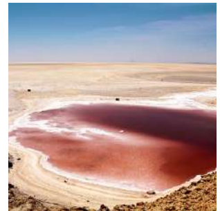
Chott el Jerid