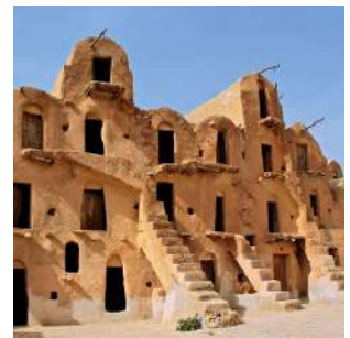
Ghorfas of ksar Ouled Soltane

After breakfast, departure for KSAR HADDADA and a visit to its fortified granary, and to MATMATA where we will admire the troglodyte houses, underground dwellings that served to escape the torrid summer heat, where the rooms opened radially from the bottom of a circular well 5 to 10 metres deep. Lunch in a restaurant. In the afternoon, transfer northwards with a stop at EL JEM to admire the amphitheatre of the ancient Roman city of Thysdrus, built around 200 years AD, the third largest in the Romanised world and the largest in Africa, declared a UNESCO World Heritage Site. Arrival in Monastir, accommodation at the Hotel Regency or similar, located directly on the beach and overnight stay in a double room with services.