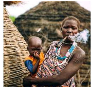
Toposa woman with a pipe