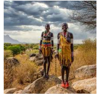
Landscapes of the Boya Hills