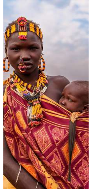
Welcome to South Sudan!

Breakfast at the hotel and transfer to TORIT. Clearance of formalities and on to the LOTUKO KINGDOM, a people who settled in the area in the 15th century, becoming sedentary and living off agriculture, livestock and fishing. Their economy and spirituality revolves around the cyclical nature of the seasons, in which the figure of the chief witch doctor, who officiates at propitiatory rites for the abundance of rain and harvests, is of particular importance. Picnic lunch en route. First visit to the village, where we will also have time to admire the sunset. Dinner prepared by our cook and overnight stay in double igloo tents.