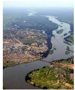
Juba and the White Nile