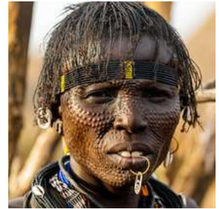
Jiye woman with scarification