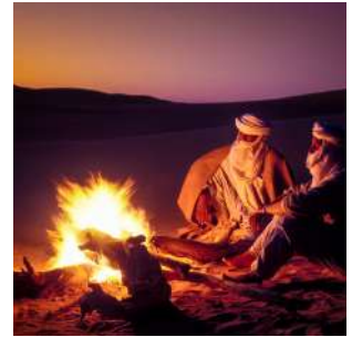
Dinner around the fire with the Tuaregs