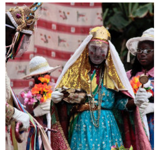
Tragedy of the Marquis of Mantua