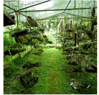
Bom Sucesso Botanical Garden