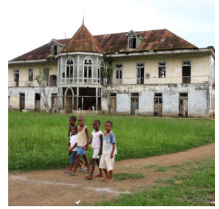
Roca Boa Entrada

Breakfast at the hotel and visit to ROCA BOA ENTRADA and ROCA AGOSTINHO NETO, where we can see numerous colonial buildings such as the hospital, the manor house and the sanzalas, where workers still live. Lunch in a restaurant and on to SANTANA, where we will make a boat excursion to the volcanic Ilheu Santana, where it is easy to meet artisanal fishermen at work. Returning to the mainland, we set off in a southerly direction towards Porto Alegre, with a stop at the viewpoint to admire the PICO CAO GRANDE, an 800-metre-high basalt monolith and symbol of the country. Arrival at the Eco-hotel Praia Inhame or similar, located on a lovely palm-fringed beach and overnight stay in a double bungalow with services.