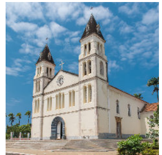
Sao Tomé Cathedral