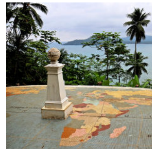
Equator Marker in Las Rolas

Breakfast at the hotel and morning dedicated to discovering the southern part of the island and the two most famous beaches of Sao Tomé, PRAIA PISCINA and PRAIA JALE'. We will find very different beaches, some with very fine white sand, washed by crystal-clear waters, others with black sand and rocks, with a very special charm. Lunch in a restaurant and afternoon dedicated to swimming relaxation or trekking (about 2 hours) through lush vegetation. Dinner at leisure followed by a night-time sea turtle watching excursion where, with a bit of luck, we will witness the incredible race of newly hatched turtles towards the sea. Overnight stay in a double bungalow with bathroom.