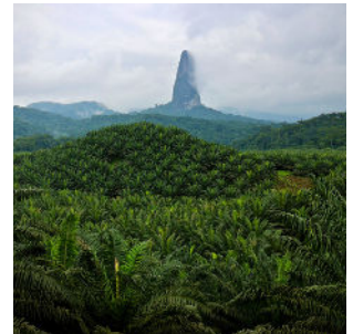
Pico Cao Grande

Breakfast at the hotel and excursion by boat to ILHEU LAS ROLAS, a handkerchief of land a few dozen metres from the coast, located towards the 'centre of the world', latitude 0 and longitude 0, where the earth divides between the northern and southern hemispheres and the equator marker is located. Walk around the island through coconut palm plantations to admire the wild beaches of the south coast. Seafood lunch on the beach, and afternoon dedicated to relaxing by the sea on the magnificent Praia Café. Return to the mainland and overnight stay in a double bungalow with services.