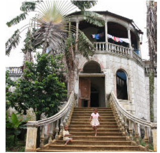
Roca Agua Itzé