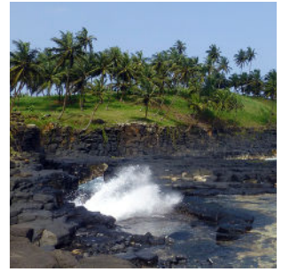
Boca do Inferno

After breakfast at the hotel, we return to the capital with stops at iconic locations on the east coast: BOCA DO INFIERNO, a peculiar natural phenomenon; PRAIA SETE ONDAS, ideal for surfing; AGUA ITZE, with its fishermen's beach and fascinating roça with panoramic views of the gulf. On arrival lunch in a restaurant. In the afternoon, you can shop for typical products and handicrafts in the capital's shops. Transfer to the airport in time for your return flight. End of services.