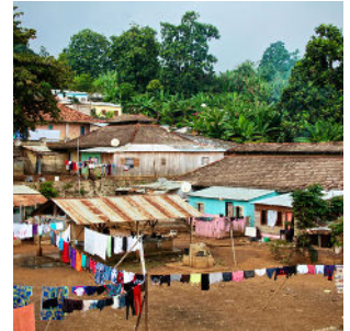
Village of Agostinho Neto