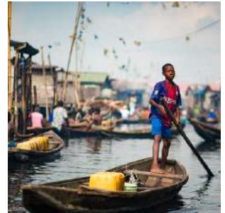
In the Makoko slum