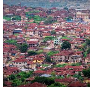
View of Abeokuta