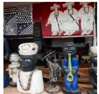
Inside the Alaka Palace