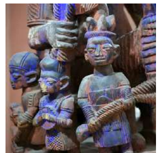
At the Lagos Museum