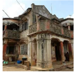
Architecture in Ijebu Ode

After breakfast we leave for IJEBU ODE, a town that preserves Afro-Brazilian vestiges, an aristocratic palace, British colonial architecture and several extravagant buildings related to the golden age of the cocoa trade. Here, we can watch a horse parade through the streets of the town. Lunch in a restaurant. In the afternoon continuation to Lagos, rooms in day use on request. Transfer to the airport in time for your return flight, end of services.