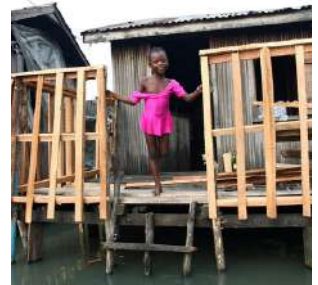
House on stilts in Makoko