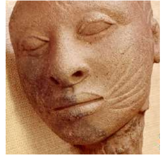
Terracotta in the Ife Museum