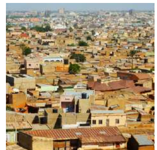
View of Kano