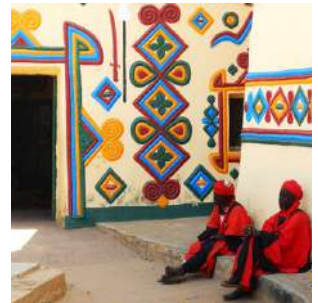
Inside the Emir's Palace