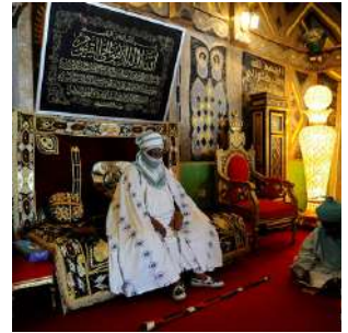
Meeting with the Emir of Kano