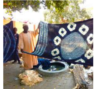
Indigo fabrics in Kofar Mata