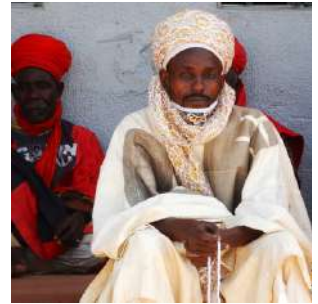
Holyman and royal guards