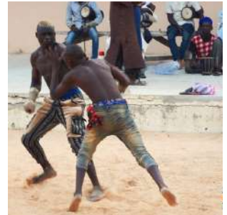
Meeting of dames