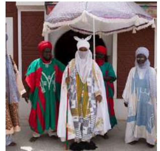
At the Emir's palace

After breakfast, we depart to a traditional ZUL village, which is particular for its facial tattoos (now only found on the faces of the elderly) and a unique 'dance of the mirrors', which we will witness. Return to Bauchi for lunch in a restaurant. Heading north towards Jigawa, we make a stop at a PEULH village, where we can witness the violent Sharo initiation ceremony, where boys are beaten with wooden sticks to test their strength and endurance. Arrival in Dutse and accommodation at the Tahir annexe or similar, dinner in a private house and overnight stay in double rooms with services.