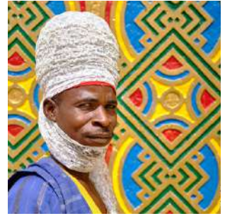
Courtier in Dutse

After breakfast, visits to Zaria end. Transfer to the small but charming DUTSE EMIRATE, capital of the federal state of Jigawa, which was part of Kano State until 1991. Along the way, in a beautiful stretch of savannah, we will admire bizarre rock formations that gave the capital its name (Dutsi means 'rocks' in the local language), with here and there a few traditional Hausa farmers' villages. Lunch in a restaurant or hotel. In the afternoon we will attend the colourful DURBAR. Accommodation at the Hotel Tahir Annexe or similar and overnight stay in a double room with services.