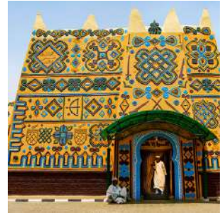
Palace of the Emir of Dutse

After breakfast, departure for the federal state of BAUCHI, the seat of the Emirate of the same name, which was created in 1809 by Yakubu Germa, a commander under the orders of Usman dan Fodio during his Islamicisation campaign in the early 19th century. Bauchi (which means 'pagan' in the Hausa language) soon became a centre for the marshalling of slaves to the north, and quarters with elaborate architecture, mosques and madrasas flourished in the city. The city was also the birthplace of Abubakar Tafawa Balewa, a central figure in the country's struggle for independence, who became Prime Minister in 1960. On the way, we make a stop at KAFIN MADAKI, to admire its ancient palace, a magnificent example of traditional Hausa architecture, and at SUMU WILDLIFE PARK, for a safari in search of giraffes and antelopes. Arrival in Bauchi, lunch in a restaurant. In the afternoon, visit to the Emir's palace and meeting with dignitaries. Accommodation at the Deno Hotel or similar and overnight.