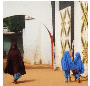
On the streets of Dutse