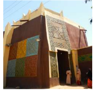
Hausa architecture in Kano