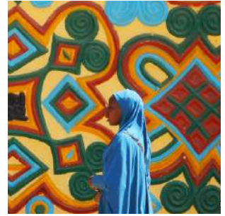
Girl with hijab in Zaria

After breakfast transfer to ZARIA one of Nigeria's oldest emirates, known locally as Zazzau, part of the federal state of Kaduna and traditionally belonging to the Caliphate of Sokoto. It's a city founded around the year 1000, it was one of the epicentres of the trans-Saharan trade, where dromedary caravans coming from the north exchanged salt for slaves, hides and kola nuts. We visit the historical centre, which preserves some richly decorated thatched and mud buildings, including one of the oldest mosques in the country (the vaults of which can still be admired inside the modern Central Mosque, built on the same site), some madrasas (Koranic schools), the market that stands on the exact spot where the caravans used to stop, and what remains of Queen Amina's 16 kilometres of walls. We will then head to the palace to meet Emir Alhaji Ahmed Ahmed Nuhu Bamalli and learn about the current role of these monarchs in the Federal Republic of Nigeria. We remain for a long time captivated by the glittering colours of the men's boubou and the women's hijabs, the tens of metres long turbans, the red tunics of the dogarin, the royal guards, in an almost dreamlike vision of an 'African Middle Ages'. In Zaria, too, we will be able to attend DURBAR on the occasion of the In Salah festival. Lunch in a restaurant and overnight stay at the Organo Hotel or similar, in double rooms with private facilities.