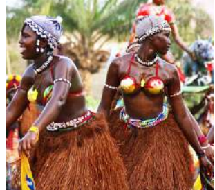
Carnival in Bissau