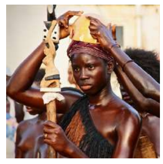
Carnival in Bubaque