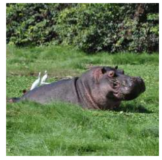
Hippopotamus in Orango