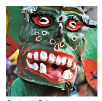
Carnival in Bubaque