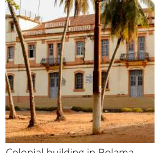
Colonial building in Bolama

Breakfast at the hotel. The morning is dedicated to visiting BISSAU: the Bissau Velho neighbourhood, the cathedral, the Palais de la Poste and the Amura fortress, the national heroes' square, the port, where multicoloured pirogues dock with their