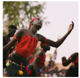
Carnival in Bissau