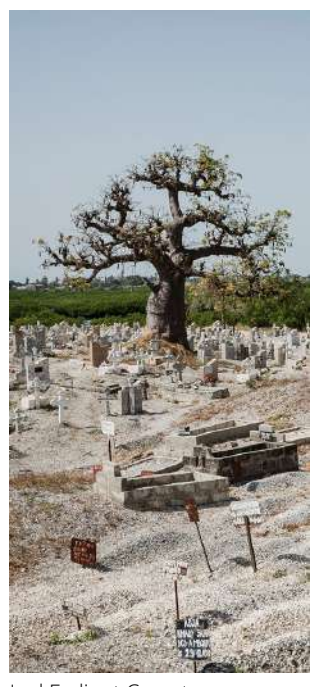
loal Fadiout Cemetery