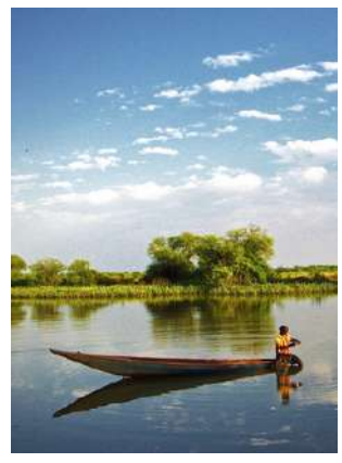
On the Casamance River