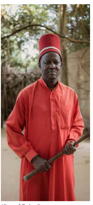
King of Bobedioum