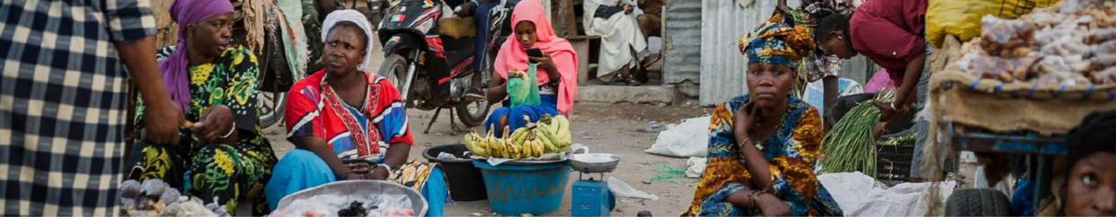
At the Kaolack market