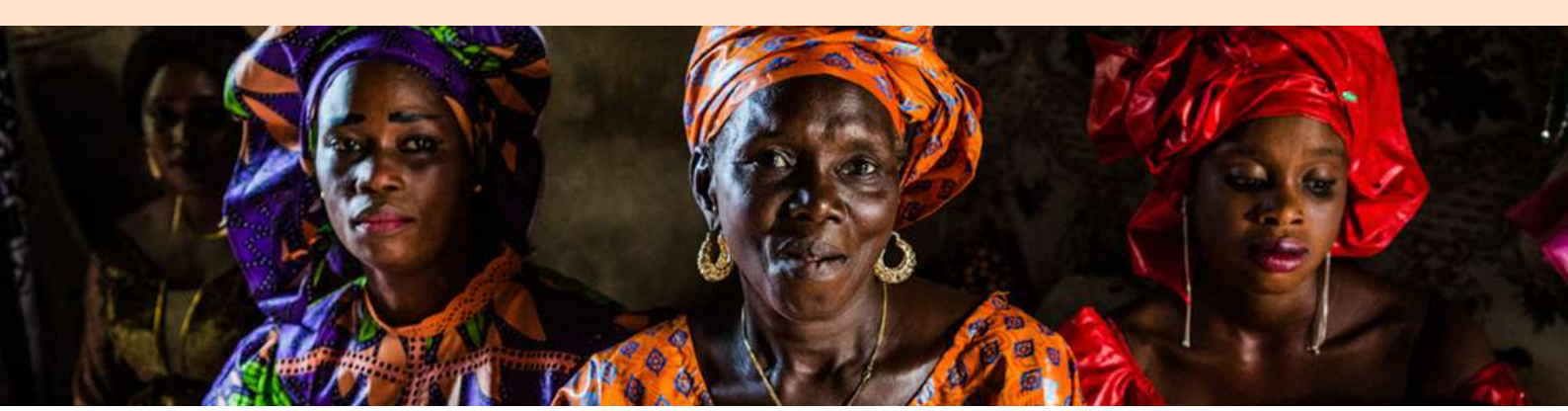
See you in West Africa!!!