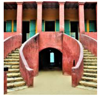
Maison des Esclaves