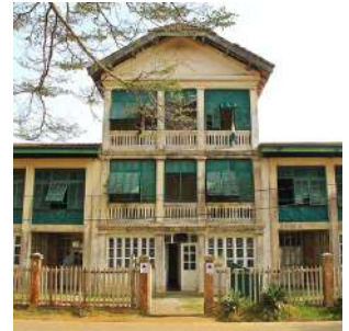
Colonial buildings in the quartier de France

After breakfast, visit GRAND BASSAM, the former colonial capital at the time of the French occupation, declared a UNESCO World Heritage Site. We stroll through the sleepy streets of the quartier de France, dotted with decadent vestiges such as the palace of Governor Binger's palace, which houses the costume museum that we will visit, and the old post office and customs house. Participate in the apotheosis of the ABISSA* FESTIVAL, the king's exit from the royal palace on a canopy from which he distributes gifts and blessings to the population. Lunch in a maquis on the lagoon. Time at leisure for shopping in craft boutiques (masks, ceramics, paintings, ...). Transfer to Abidjan, some rooms in day use at the Hotel Onomo or similar. Free dinner followed by transfer to the airport, end of services.