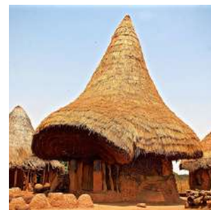
Niofoins' House of Fetishes

After breakfast, visit NIOFOINS, a typical village with its tapered Senoufo granaries, to admire its conical, pointed fetish houses, up to 5 metres high. Departure for BOUNDIALI, where in a village we will witness the NGORO dance, part of the young girls' initiations. Lunch in a restaurant. This is followed by a visit to a PEULH VILLAGE, an ethnic group of nomadic herdsman of Nilotic origin present throughout the Sahél, characterised by their wide-brimmed hats and the tattooing on the lips of married women. Continuation to ODIENNE, accommodation at the Hotel des Frontieres or similar, overnight stay in a double room with services.