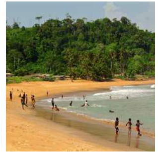
Grand Bassam Beach