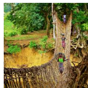
Bridge of lianas