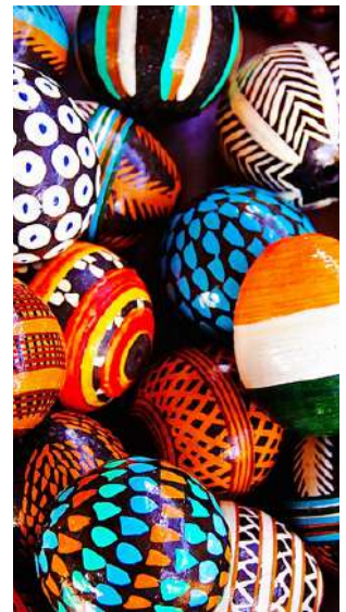
'Pearly' of Kapele