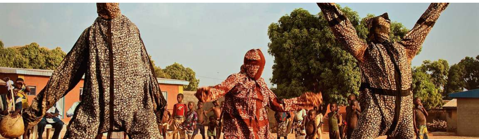
Dance " of the panther " Boloie