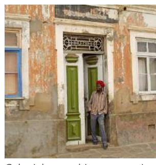
Colonial architecture ir Namibe