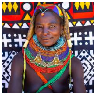
Welcome to Angola!

Breakfast at the hotel and a day dedicated to discovering one of Angola's most iconic and decorated tribes, the MUILA (also known as Huila or Mumuhuila). We visit the community of Kamuviu, where we meet the 'Muila of the plains': we greet the Soba (local chief) and his many wives. Mainly farmers, the older generations continue to worship the bull god, although cattle breeding is no longer a key element in their economy. Continuation to the small colonial town of CHIBIA, formerly Joao d'Almeida. Lunch in a restaurant and short walk to the neo-Baroque style church. From Chibia we head to the Mukuma area to meet the more conservative 'mountain Muila'. Stroll through the market where we will meet fully decorated women intent on bargaining for traditional wooden tribal dolls and nyianeka textiles. Return to Lubango and overnight at the hotel.