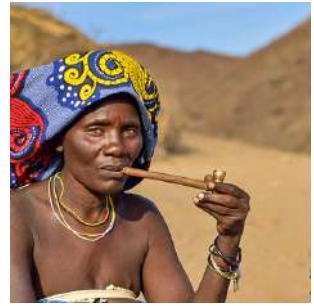
Cubal woman with characteristic ompota