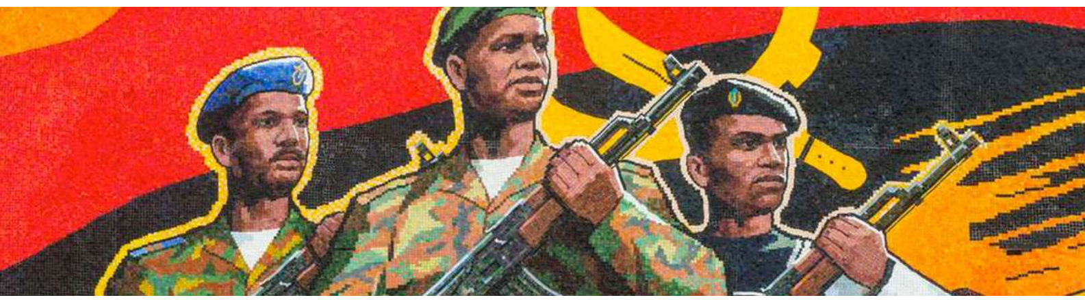
Murals in the streets of the capital