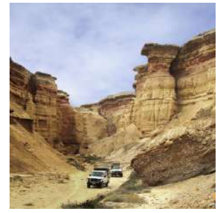
Canyon of Curoca