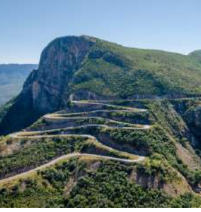
Serra de Leba

Breakfast at the hotel and entry into the IONA PARK, where we make an initial stop to admire the Vanessa wreck. Proceeding along the shoreline, we can admire the majestic dunes of the Iona Desert, which plunge into the Atlantic Ocean, creating a wall of sand some 40 kilometres long. The ochre and yellow streaks of sand are reminiscent of a tiger's coat, hence the exotic name BAIA DOS TIGRES. Picnic lunch and continuation to the south depending on the tides. Time dedicated to exploring the bay, where flamingos, seals and turtles can often be spotted. If sea conditions permit, a boat trip can be organised to ILHA DOS TIGRES, some ten kilometres off the coast, and the ghost town of Sao Martinho, once a thriving fishing town, where the remains of a church, houses and the factory where the fish was canned are now abandoned. Return at the end of the afternoon to Tombwa and overnight at the hotel.