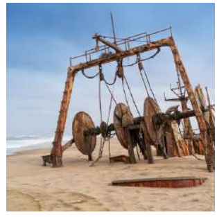
Wreck along the beach