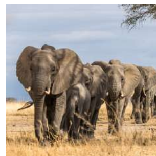
Elephants in the Tarangire

After breakfast, assistance in carrying out the PCR test. Afterwards, departure for TARANGIRE PARK, in an environment of savannahs dotted with huge baobabs and termite mounds, floodplains, forests and swamps, where the scene is dominated by large groups of elephants, which abound in the park (more than 100 can be spotted on a single safari, and at very close quarters), and the birdlife is particularly diverse (more than 550 species). Lunch box. Late afternoon drive to Babati, accommodation at Asmorein Lodge or similar, dinner and overnight in double rooms with private facilities.