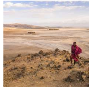
Towards Lake Natron