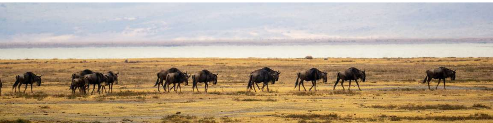
Wildebeest in the Ngorongoro