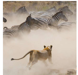
Lioness on the hunt