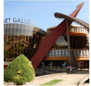
Cultural Heritage Centre in Arusha