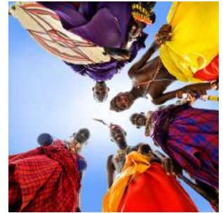
Welcome to Tanzania!

After breakfast we depart north to the Kenyan border to the town of Longido. From here a comfortable track through volcano-dotted savannah will take us to the Maasai village of ENGARESERO, at the foot of the monumental Ol Doinyo Lengai volcano, which will be our base for exploration over the next few days. Accommodation at Giraffe Masai Lodge, lunch and relaxation in its spring water pool. In the afternoon, the first exploration of the area on foot, among boma (groups of huts) of the Maasai ethnic group and Maasai giraffes ( Giraffa camelopardalis tippelskirchi ) characteristic for their serrated-edged spots. For those who wish, it will be possible to make a trek (about 1h30/2h00 round trip) to the Engaresero waterfalls, on a route that follows the bed of the river of the same name (which on several occasions must be forded) through wide gorges that lead to a mighty waterfall and a natural pool at its foot, where you can bathe or simply cool off. Return to the lodge, dinner and overnight stay in en-suite double rooms.