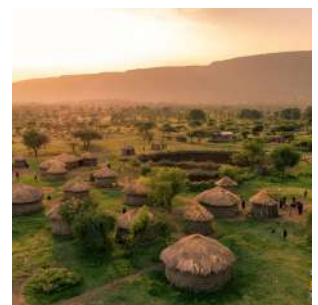
Masai village at sunset