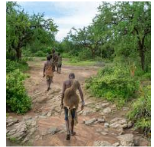
Hunters with baboon skins