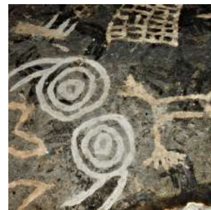
Rock paintings in Pahi