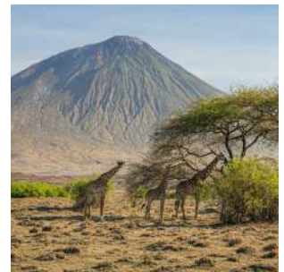
Giraffes under the Ol Doinyo Lengai volcano