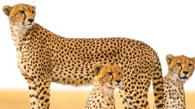
Cheetahs in the Savannah