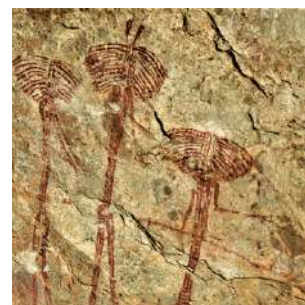
Rock paintings in Kolo