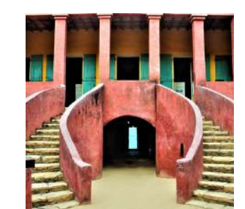
Maison des Esclaves

After breakfast we will drive through the chaotic city of DAKAR, appreciating its architecture and some of its squares and monuments, such as the colonial station from where the famous Dakar-Bamako train still departs, to the pier where we will take the ferry to the GOREE ISLAND, a UNESCO World Heritage site. Here, amidst narrow streets, pretty, brightly coloured houses, climbing bougainvillea and handicraft boutiques, we admire the Maison del Esclaves, a colonial house from 1776 where slaves were imprisoned before passing 'the gate of no return' and taking the route to the Americas, and the ramparts from where you can admire the entire island. Lunch in a restaurant. We return to the mainland and visit the exhibitions of the DAK'ART BIENNALE OF CONTEMPORARY AFRICAN ART. Overnight stay at the hotel.