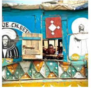
Through the streets of Guet N'Dar

After breakfast we depart for JOAL and visit FADIOUT, an island formed entirely of shells, where we admire the Cathedral, a splendid view of the granaries on stilts and the colourful mixed Muslim and Christian cemetery, a great example of religious tolerance. Lunch in a restaurant and on to Dakar, where we will visit the exhibitions of the DAK'ART AFRICAN CONTEMPORARY ART BIENNIALE. Accommodation at the Lodge des Almadies or similar and overnight stay in a double room with services.